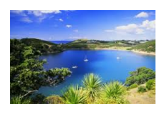
Islands in the Hauraki Gulf