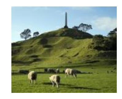
One Tree Hill