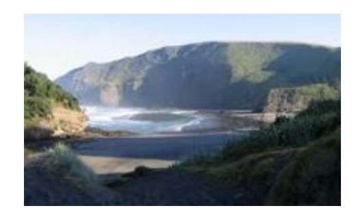
Sand Surfing the volcanic black sand dunes at Bethells Beach

We also offer a School Study and Culture experience which includes Kiwi Activities and Sightseeing. Tour group arrangements to be negotiated with the school.