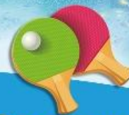
Table Tennis Holiday Program at North Harbour Table Tennis Stadium

5A Akoranga Drive, Northcote (behind Y.M.C.A.)